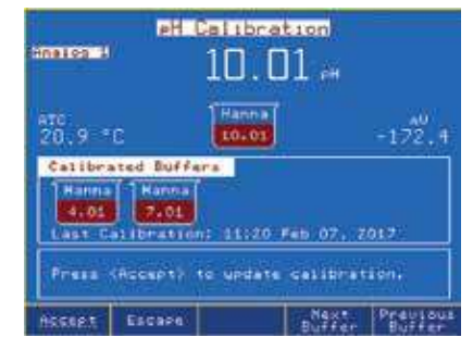
Up to five-point pH calibration with automatic buffer recognition

Titration graphs can be viewed onscreenor saved as images and transferred along with titration report