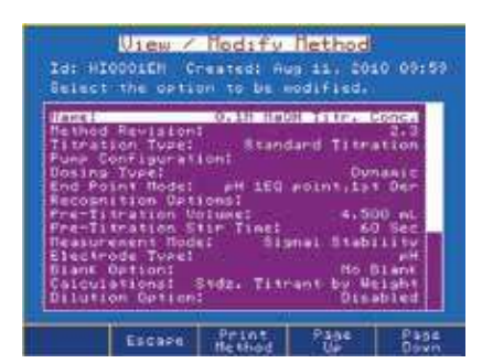
Fully customizable titration methods.

Data to be stored in tiration reports is fully customizable