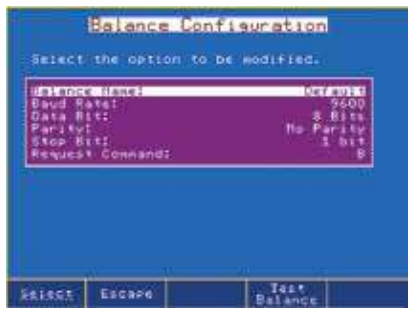
Fully configurable balance interface.

Titration or pH/mV/ISE results can be viewed on-screen or transferred to a USB flash drive or PC